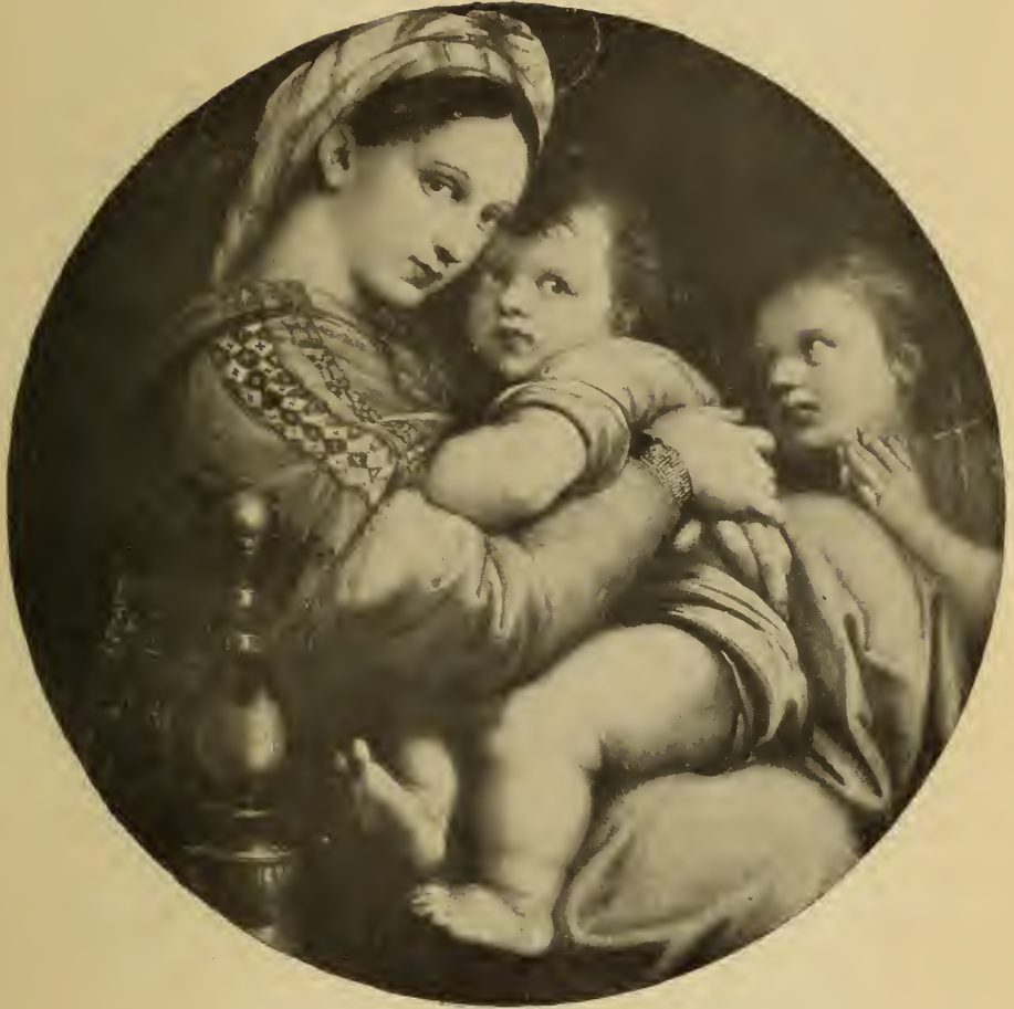
THE MADONNA DELLA SEDIA (OF THE CHAIR) FROM THE PAINTING BY RAPHAEL IN THE PITTI